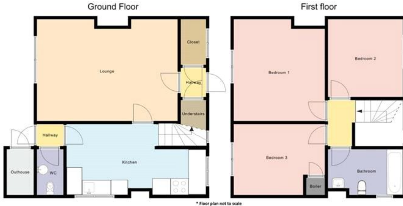
* Floor plan not to scale